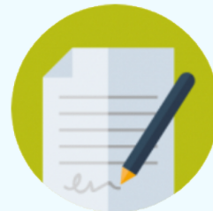
Unforeseen Illness, Injury or Death (including Coronavirus)

As the Coronavirus pandemic continues to disrupt life on a global scale, we've yet to understand what our "new normal" will be. What we do know, however, is that the virus could potentially impact people's holiday plans for some time to come.